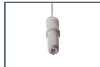
K = 1.5 mm connector